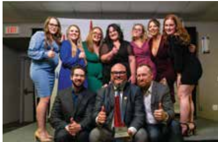
Business of the Year Award Sponsored by Grant Thornton LLP Harbour Landing Village Regina