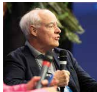
The Hon. Perrin Beatty, CEO of the Canadian Chamber of Commerce, discusses how to position Western Canada on the global stage.