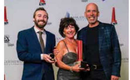
Community Involvement Award Sponsored by Saskatchewan Blue Cross Wiegiers Financial & Benefits Saskatoon