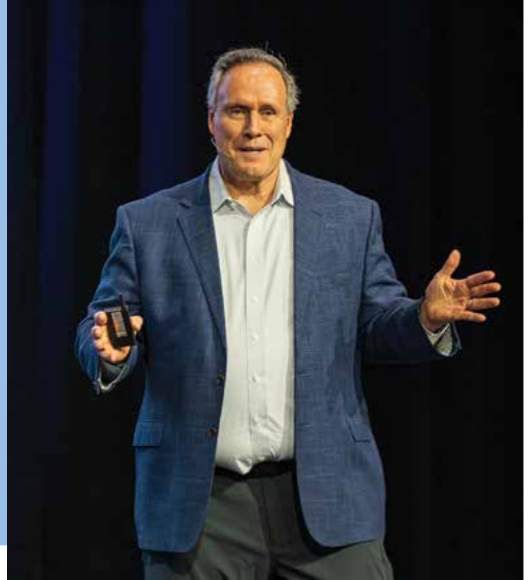
Featured keynote Stephen M.R. Covey inspires and motivates attendees during his "The Future of Leadership" talk.

On November 16, 2023, we held our inaugural PowerUp Summit: Growth Strategies for Saskatchewan Businesses in Saskatoon. The event brought together small and medium-sized businesses for a day of interactive workshops, valuable networking, and an inspiring keynote address by leadership expert, Stephen M.R. Covey.