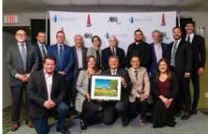
Saskatchewan Business Hall of Fame The Hill Companies Regina